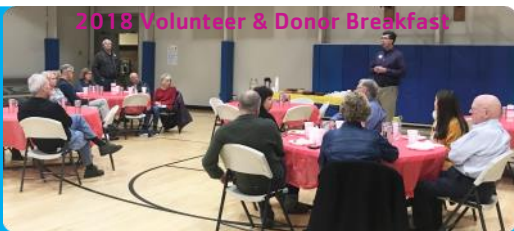
2018 Volunteer & Donor Breakfast

It's easy to make real change in your community through volunteering. And at the Y, your options are wide open. Use your time and talent to create an impact that really counts – coaching a youth sports team, extending a hand to help seniors, or cheering on runners at a 5K race. Interested in giving back?