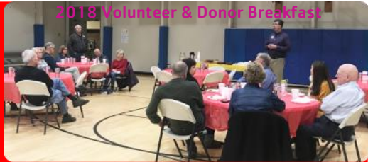
2018 Volunteer & Donor Breakfast

It's easy to make real change in your community through volunteering. And at the Y, your options are wide open. Use your time and talent to create an impact that really counts – coaching a youth sports team, extending a hand to help seniors, or cheering on runners at a 5K race. Interested in giving back?